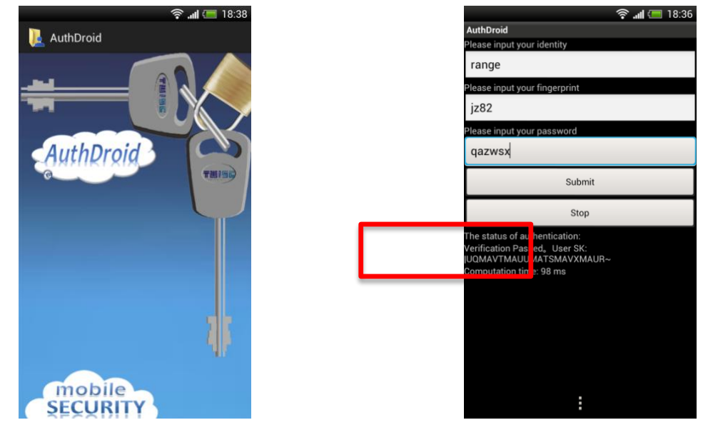
Figure. 2. Client Program on Android (HTC ONE X: 1.5 GHz, quad-core, RAM 1 GB, Android 4.1.1)

Fig. 2 shows the client program. To initiate a login, the user needs to input his identity, password and fingerprint. Then, the user clicks the "Submit" button, and the client program starts AuthDroid with the server program, as shown in Fig. 3. Our implementation results show that AuthDroid takes about 149.7 microseconds for the client program to complete the whole authentication procedures of AuthDroid with the server program. We obtained this average time from 200 runs of AuthDroid . As the HTC ONE X is a common smartphone, our implementation reflects the practicability and feasibility of the proposed authentication scheme.